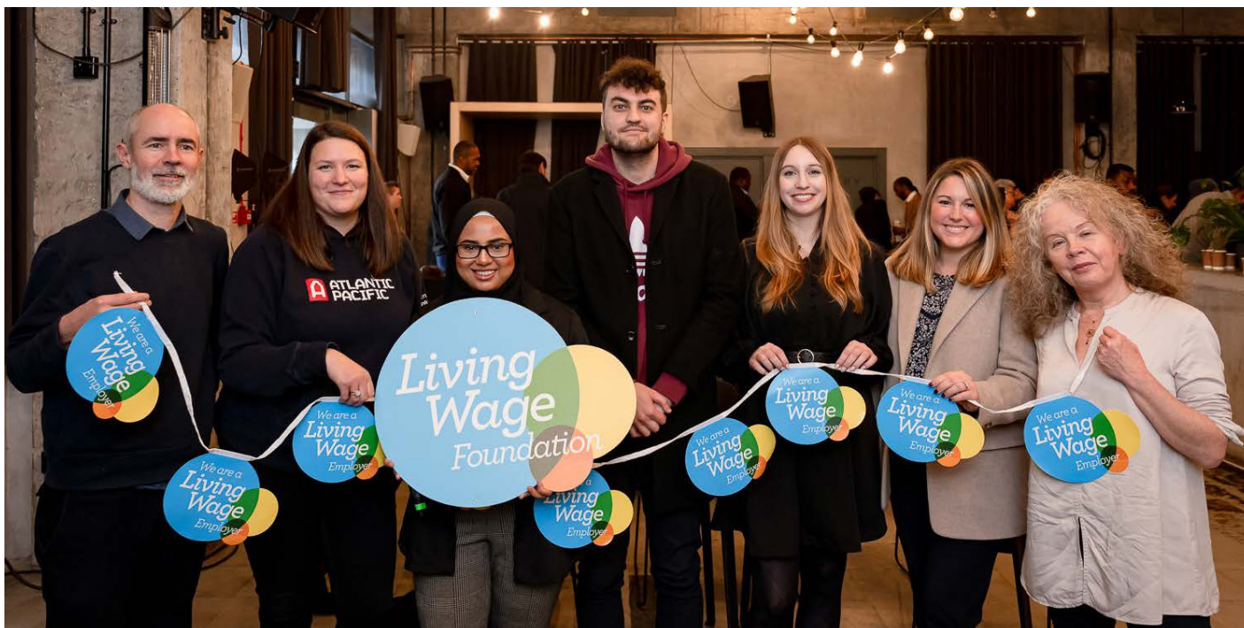
Two employees spoke on a panel at the Living Wage Week 2022 event organised by Newham Council, The Royal Docks Living Wage Action Group and the Living Wage Foundation.

4.4. We committed to campaigning to make our neighbourhood, the Royal Docks, a Living Wage Place. To this end, we have helped create the Royal Docks Living Wage Action Group, a coalition of local public, private and third sector accredited employers and community members, formally recognised by The Living Wage Foundation. Additionally, we have supported events and publicity for the Royal Docks Living Wage Action Plan. We also encourage other businesses and organisations in the area to become accredited. This work will help improve employment conditions in the communities around us, as well as make people more aware of poor pay and modern slavery in our communities.