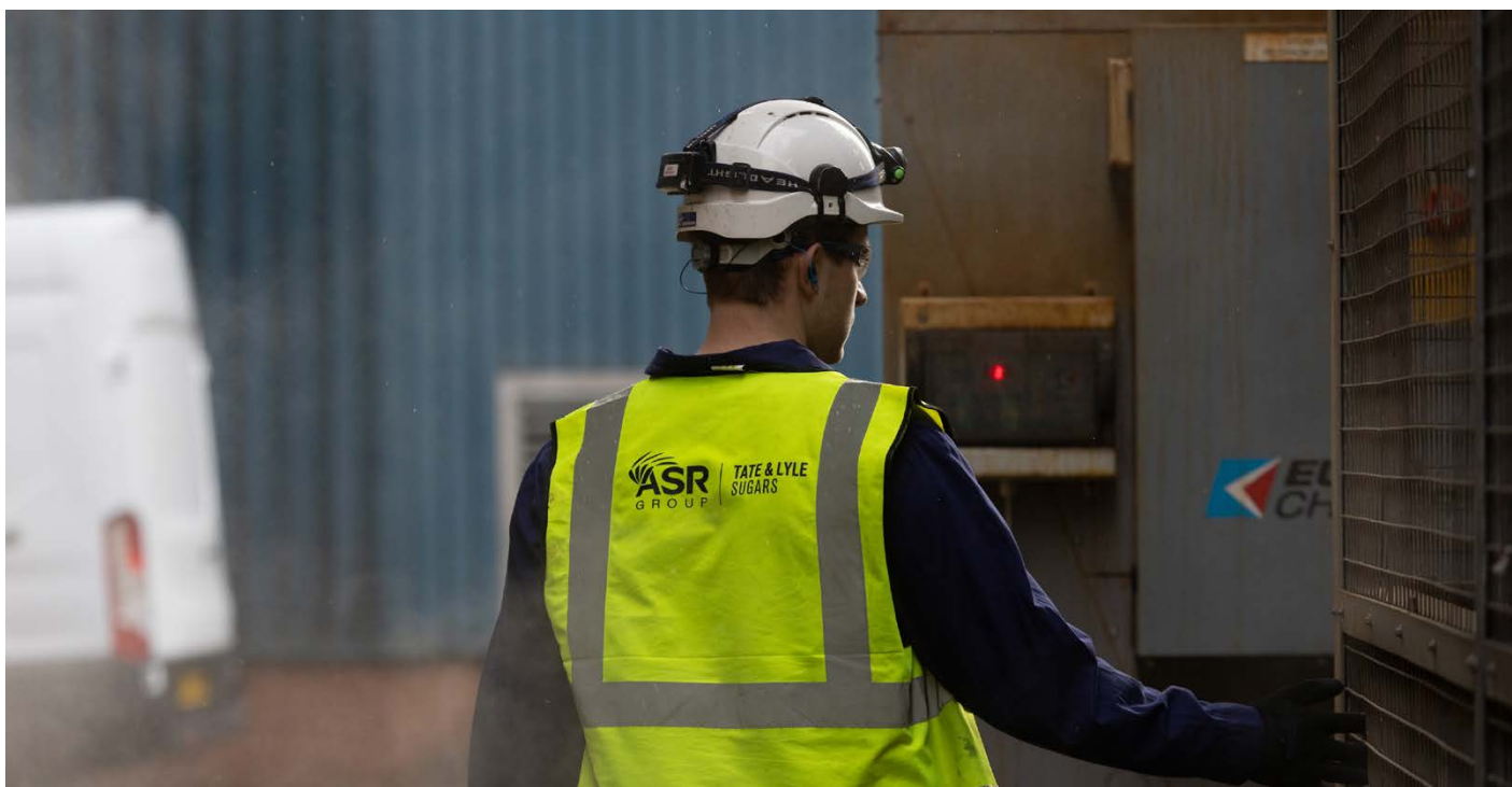
An engineer at Thames Refinery.