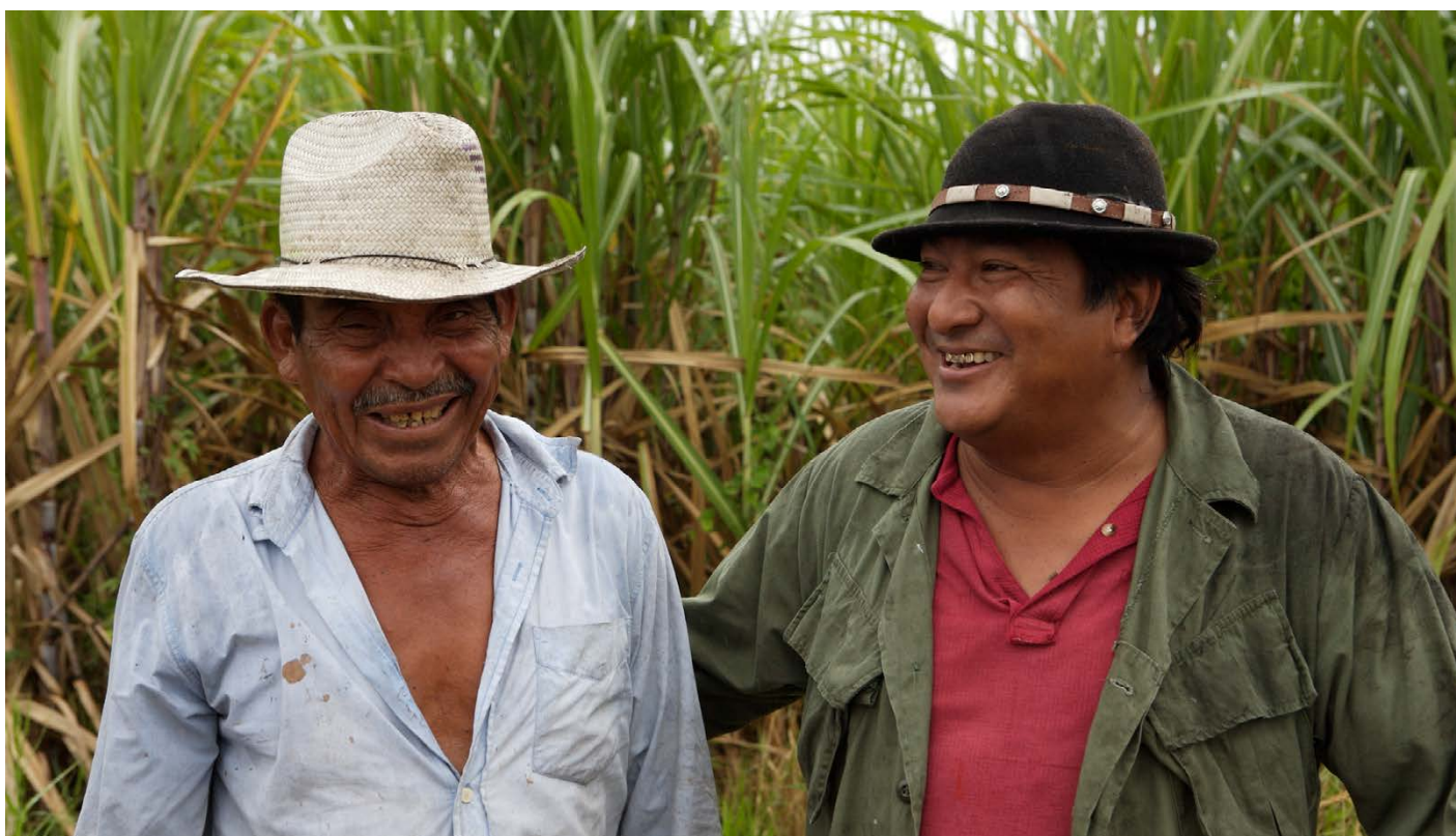
Smallholder cane farmers in Belize.

We have a Modern Slavery Protection Plan to further address the risk of modern slavery in our own operations. The policy document sets out the steps to ensure that at each of our operations, colleagues are aware of their roles and responsibilities regarding preventing these crimes and how to protect the potential victim, the evidence, other colleagues and our business if they suspect that colleagues may be victims of such crimes.