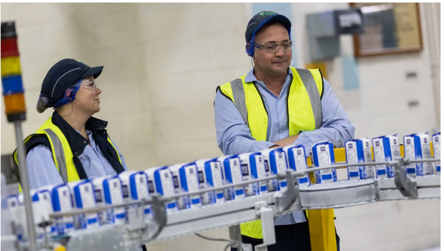
Packing operators on the sugar packing lines at Thames Refinery.

In 2020 Tate & Lyle Sugars became an accredited Living Wage employer certified by the Living Wage Foundation. The Foundation independently calculates a real Living Wage that meets the cost of living and being accredited means we commit to paying this to all direct employees and contractors. Prior to becoming an Accredited Living Wage employer we had very few direct employees below the living wage rate, but around 40 contractor colleagues, such as cleaners and security staff, received an uplift in pay as a result of accreditation.